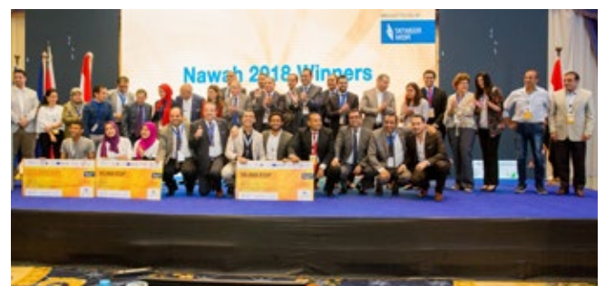
Winners of Nawah Social Entrepreneurship Competition 2018

for young people using a multi-pronged approach that works on the demand, supply and matching processes for youth employment in the industrial, tourism and agricultural sectors.