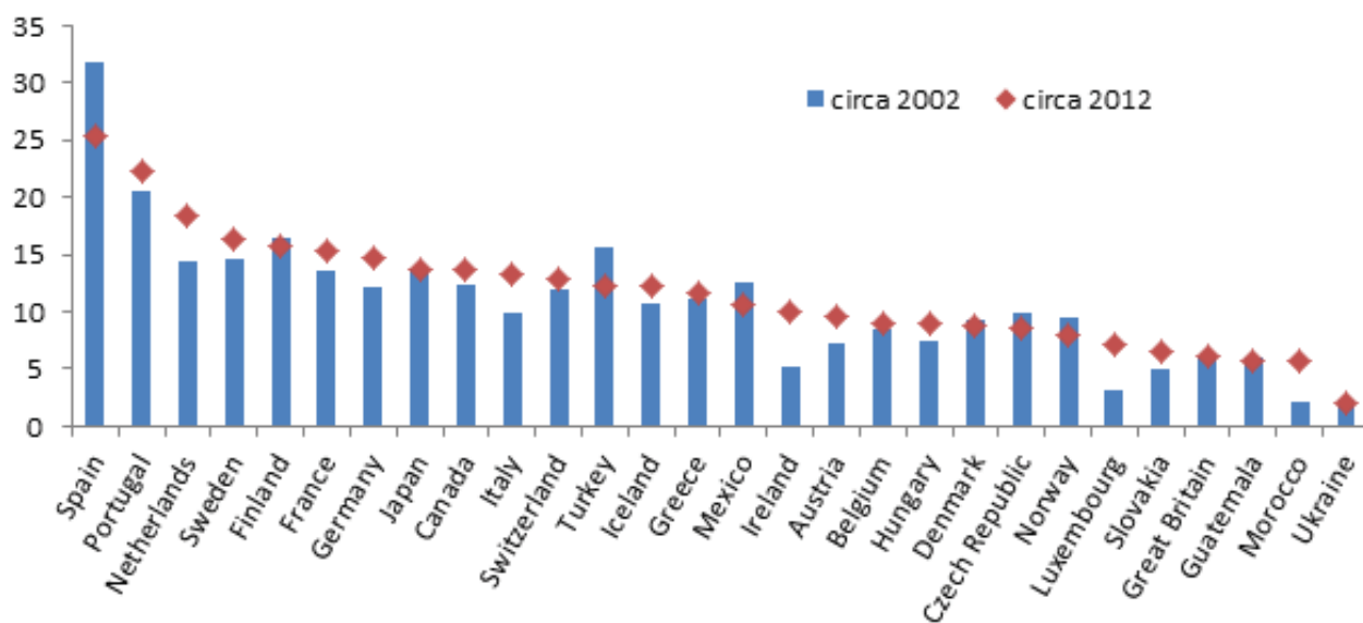
Figure 2. Trends in FTC in Selected Countries, around 2002 and 2012

Note: Workers with FTC as per cent of all wage employees.