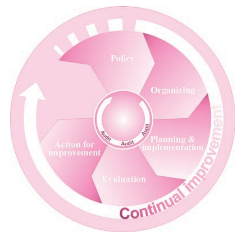
Figure 2. Main elements of the OSH management system

Occupational safety and health, including compliance with the OSH requirements pursuant to national laws and regulations, are the responsibility and duty of the employer. The employer should show strong leadership and commitment to OSH activities in the organization , and make appropriate arrangements for the establishment of an OSH management system. The system should contain the main elements of policy, organizing, planning and implementation, evaluation and action for improvement, as shown in figure 2.