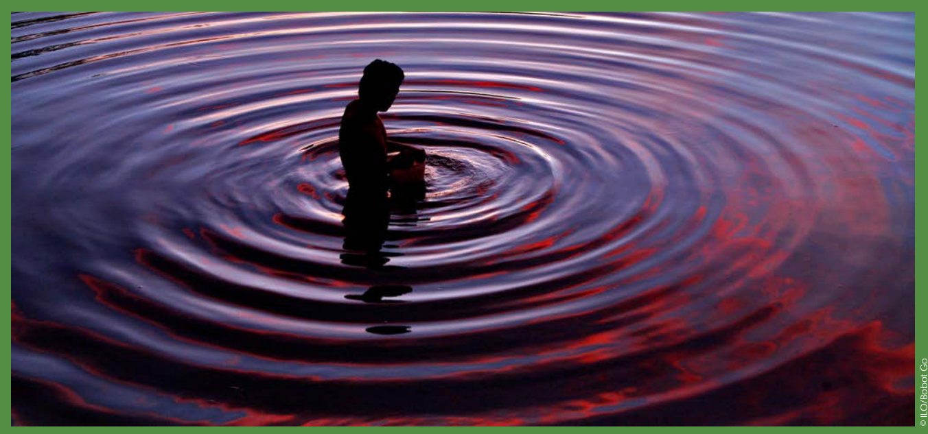
Fishing at dusk in Muntinlupa City, Philippes A fisherman hooks up bait in the water2012.

Tackling transnational fisheries crime requires global scale investigations into the highly organized and well-financed crimes and criminals. In order to bring to justice the individuals controlling the criminal networks, fisheries experts and practitioners need to engage with the police, judiciary, customs, tax, port, security and labour authorities to gather and share information, intelligence and knowledge and to pool investigative resources.