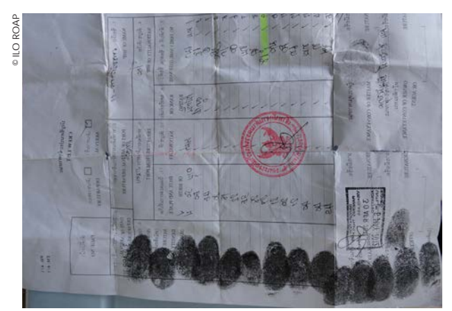
Sample crew list with migrant finger prints, Thailand.

Capacity building programmes and train-the-trainers initiatives will be developed to improve the capacity of government agencies in port states, as well as prosecutors to investigate and prosecute offences. Inspector and investigator manuals will be developed on how to detect, inspect and investigate forced labour and allegations of abuse in fisheries. Awareness-raising campaigns targeting migrant workers, labour inspectors, policy makers, harbour officers, flag state administrations, media, retailers and consumers will be undertaken to improve the knowledge of forced labour and human