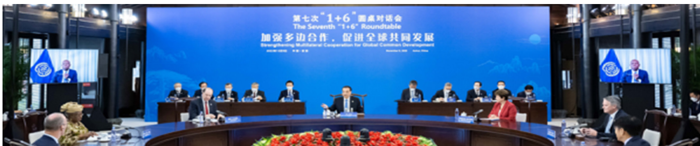
On December 9, 2022, China's State Council held the seventh "1+6" Roundtable with heads of six major international organizations. ILO Director-General Gilbert F. Houngbo joined the meeting virtually. They had in-depth exchanges on China's economic situation, deepening reform and opening up, among others.