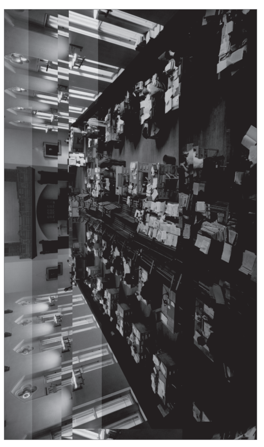
ILO's temporary premises at The Presbyterian College of Montreal (now Morrice Hall), McGill University, Montreal, August-November 1940.