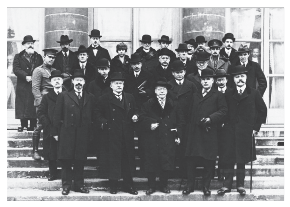
The Commission on International Labour Legislation at the Paris Peace Conference, February–March 1919.