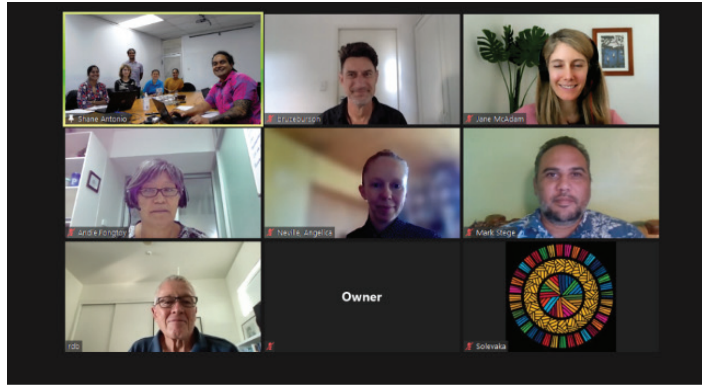
Technical Advisory Group meeting in March 2021