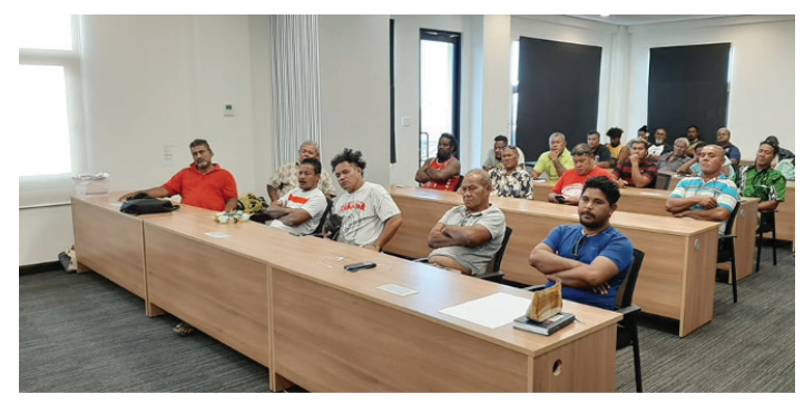
Tuvalu Seafarer refresher course training in session.