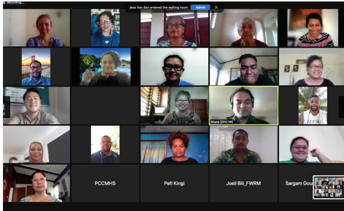
Regional Civil Society Consultation on Climate Mobility

The Pacific Climate Change Migration and Human Security (PCCMHS) programme recently (22-23 June) hosted a virtual regional civil society consultation on climate related mobility. The online consultations that were organized by the International Organization for Migration (IOM) provided an opportunity for civil society representatives from around the Pacific to