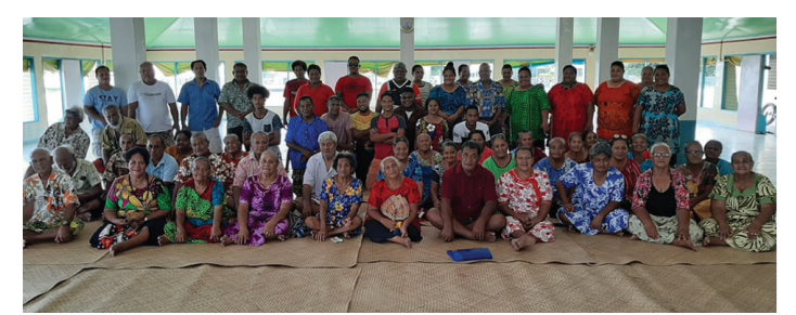
Vaitupu Community Consultation at the Anipule II Community Hall