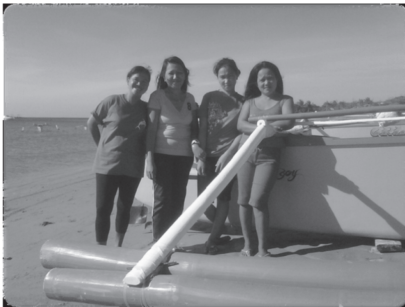
Filipino migrant women back home in their fishing village in northern Philippines