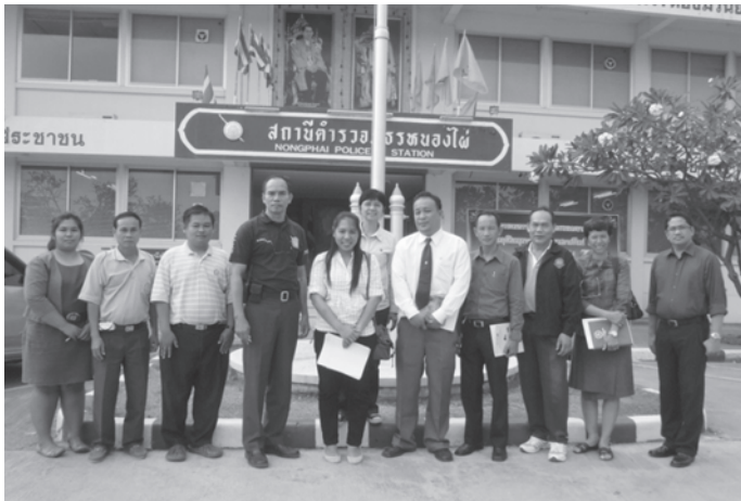
MDT in Petchabun Province, Thailand

were carried out in selected areas to find returned migrants who had experienced labour exploitation and/or human trafficking and might be in need of assistance. This resulted directly in locating a number of new cases who were subsequently assisted through the MDT.