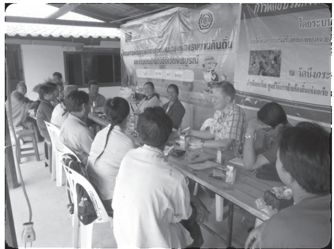
Meeting of Thai migrant workers returned from Sweden