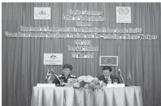
Signing ceremony between the Thai Department of Labor (DOL) and the International Labour Organization (ILO) to formalize their cooperation to improve recruitment practices and protect migrant workers.