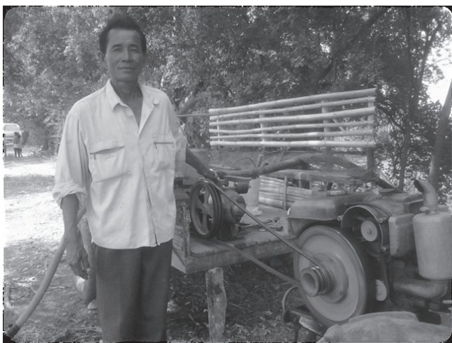
Thai migrant worker returned from Sweden

as community watchdogs who monitored the recruitment practices to identify vulnerable groups and returned migrants who might need assistance.