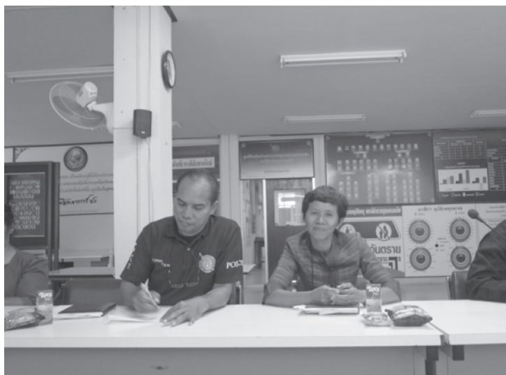
MDT members: a police officer and a volunteer lawyer in Petchabun, Thailand