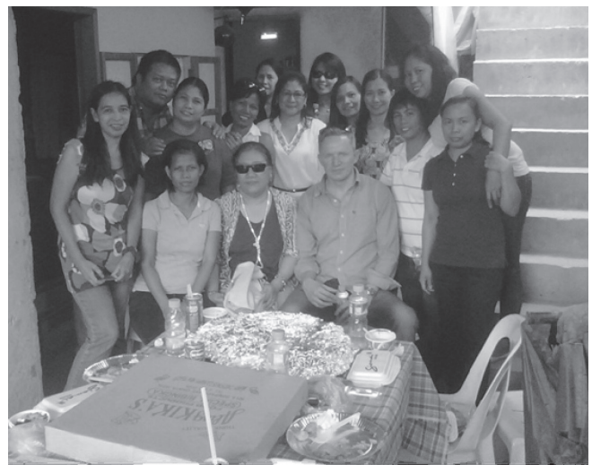
Filipino women returned from labour exploitation in Romania; through the ILO–EU Project and OWWA assistance, they have been successful in establishing a cooperative and their own clothes production for a sustainable livelihood