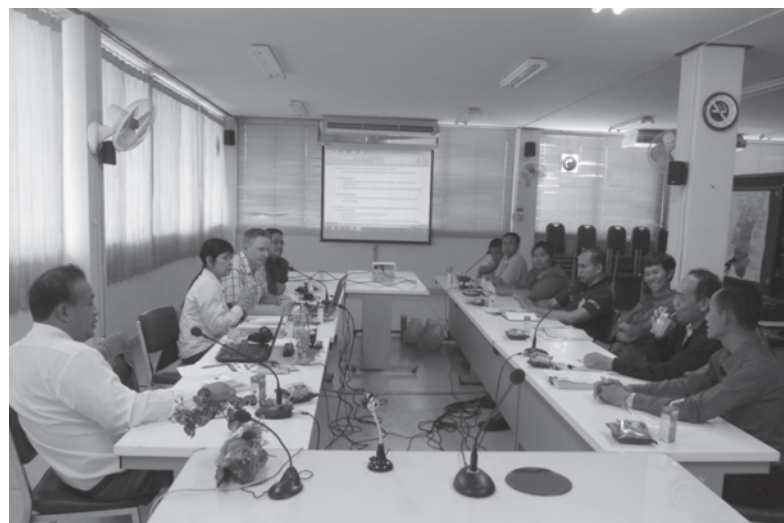
MDT meeting, Petchabun, Thailand

labour exploitation of migrant workers and to find ways to contribute to the common goal of protecting and assisting migrant workers.