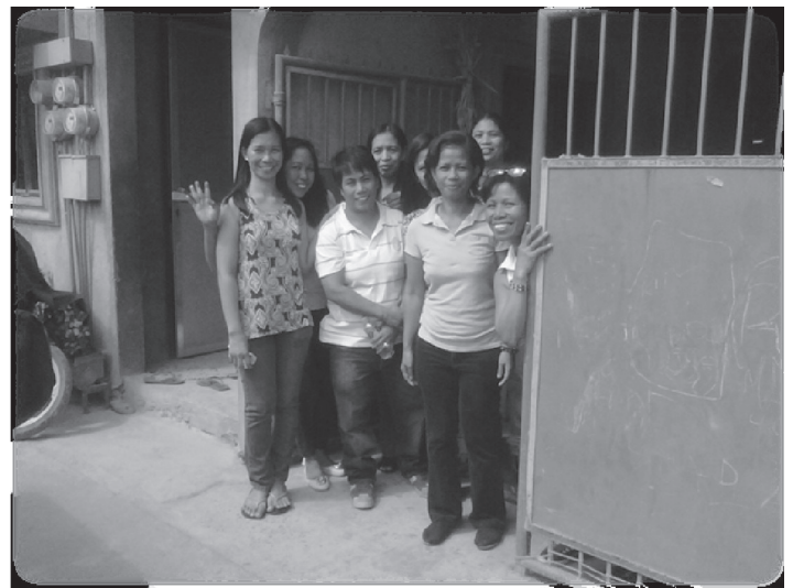
Filipino women returned from labour exploitation in Romania