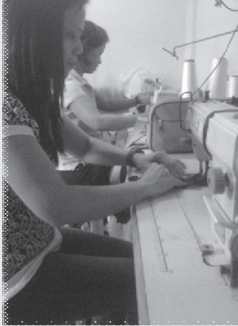
Filipino women returned from labour exploitation in Romania. Through assistance they have been successful in establishing a cooperative and their own clothes production for a sustainable livelihood.

Among the returned migrants assisted through the ILO–EU project were a group of 47 Filipino women migrants who had been victims of deceptive recruitment and labour exploitation in a garment factory in Romania. They had all migrated to work in Romania through a recruitment agency in Manila and signed contracts that promised them a basic monthly compensation of US$400, including guarantees for twice the hourly wage for overtime, plus free food and accommodation. Based on these conditions and the expectation of a monthly income of US$600–$800, the women decided to risk taking loans to cover the recruitment agency fee and the travel costs of US$2,500 per worker.