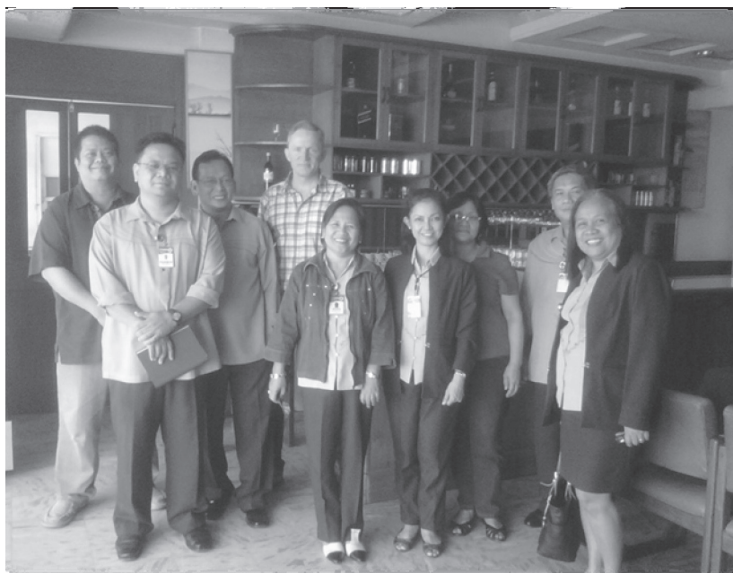
Some of the officials and professionals involved in developing the Migration and Development Strategic Plan (2012–16) for La Union, Philippines

The La Union Migration and Development Strategic Plan (2012–16) was launched in a provincial summit in September 2011. About 140 national and local migration actors attended the event, with the Undersecretary of the Department of Labor and Employment delivering the keynote speech (on behalf of the Secretary of Labor and Employment).