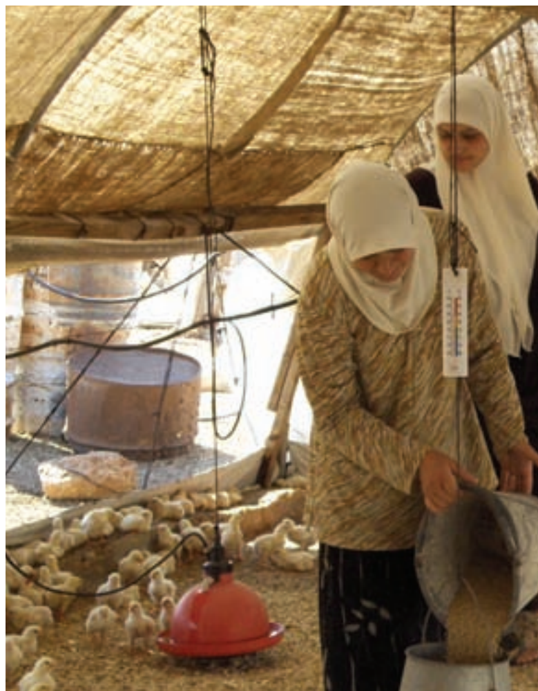
Poultry Farming Cooperative - Salfit

Gender disparity is mainly attributed to women’s limited access to and control over the physical and financial resources needed for obtaining