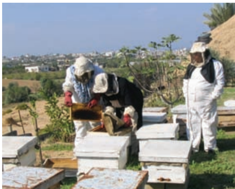
Beekeeping Cooperative -Gaza

Despite the concentration of women memberships in mixed and women-only cooperatives in certain sectors, men still dominate the majority of cooperative sectors as a whole. Women have especially limited membership in services (6 percent). To increase productivity and women's integration, cooperatives need support in identifying new niche markets – especially in services. The objective is not merely to increase the volume of women's employment opportunities, but also the diversity.