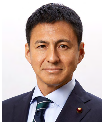
Hon. TAKEI Shunsuke State Minister for foreign affairs, Japan

Mr. TAKEI Shunsuke is a Japanese politician who currently serves as State Minister for Foreign Affairs since August 2022. A member of the Liberal Democratic Party, He was reelected to the House of Representatives (49 th General Election, fourth term).