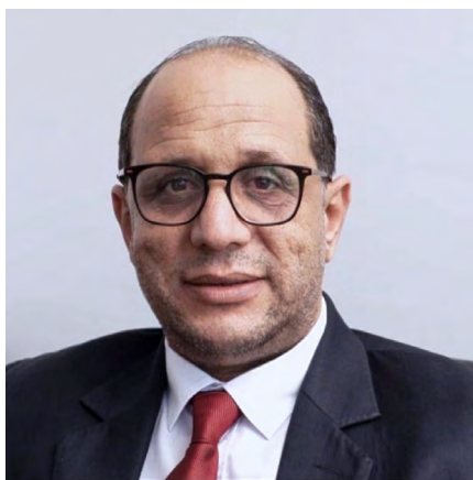
Hon. Malek Ezzahi