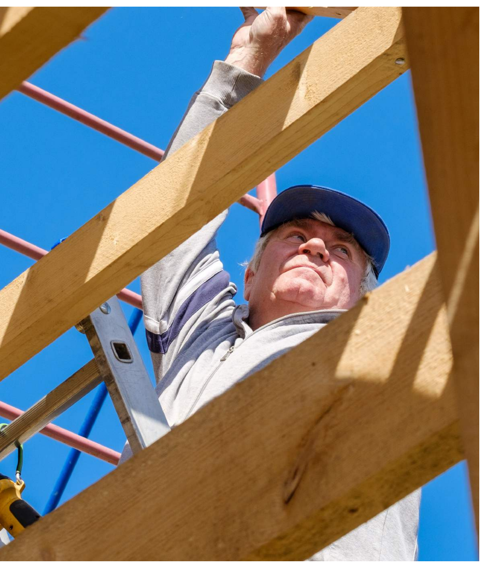
Facilities for trade union officials and members to exercise their rights-A comparative review and the comparative review and the comparative review and the comparative review and the comparative review and the comparative review and the comparative review and the comparative review and the comparative review and the comparative review and the comparative review and the comparative review and the comparative review and the comparative review and the comparative review and the comparative review and the comparative review and the comparative review and the comparative review and the comparative review and the comparative review and the comparative review and the comparative review and the comparative review and the comparative review and the comparative review and the comparative review and the comparative review and the comparative review and the comparative review and the comparative review and the comparative review and the comparative review and the comparative review and the comparative review and the comparative review and the comparative review and the comparative review and the comparative review and the comparative review and the comparative review and the comparative review and the comparative review and the comparative review and the comparative review and the comparative review and the comparative review and the comparative review and the comparative review and the comparative review and the comparative review and the comparative review and the comparative review and the comparative review and the comparative review and the comparative review and the comparative review and the comparative review and the comparative review and the comparative review and the comparative review and the comparative review and the comparative review and the comparative review and the comparative review and the comparative review and the comparative review and the comparative review and the comparative review and the comparative review and the comparative review and the comparative review and the comparative review and t

21. In 1951 the ILO set up the Committee on Freedom of Association (CFA) for the purpose of examining complaints of violations of freedom of association, whether or not the country concerned had ratified the relevant Conventions. Paragraph 14 of the Special procedures for the examination of complaints alleging violations of freedom of association provides that the mandate of the CFA "consists in determining whether any given legislation or practice complies with the principles of freedom of association and collective bargaining laid down in the relevant Conventions." The International Labour Office published a concise compilation of the decisions of the Freedom of Association Committee. This Compilation evidences on the basis of these decisions the conceptual link between the right to organize and the issue of facilities for workers' representatives by integrating this issue into the compilation. Thus the following issues are listed under the heading of "facilities":