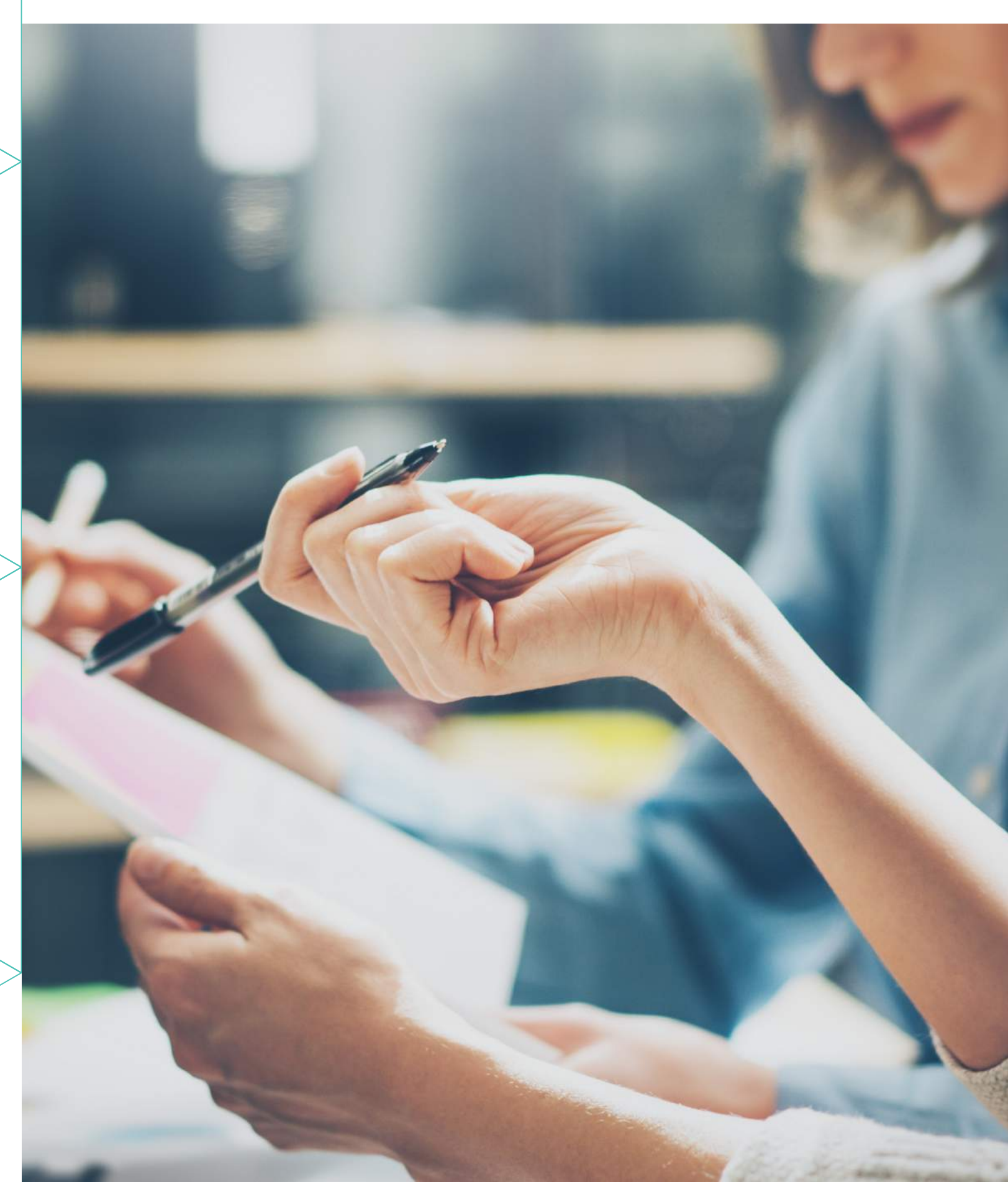
Facilities for trade union officials and members to exercise their rights – A comparative review