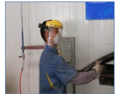
Face mask provided to protect eyes and face