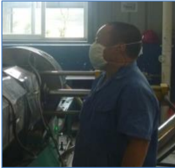
Standard gauze masks