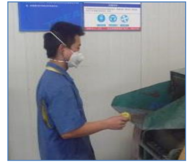
Simple gauze masks