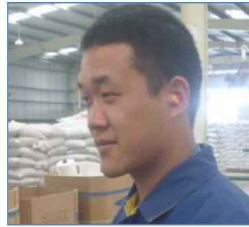
Earplugs without safety cord