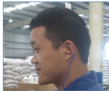
Cord added to prevent dropping out