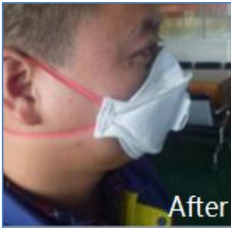
3M 9332 anti-dust masks