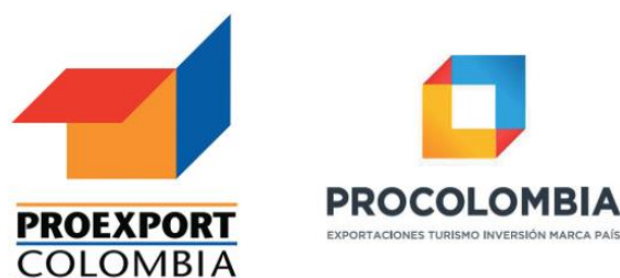
Figure 1: ProColombia logo 2016

Since 2004, ProColombia assumed the promotion of FDI. Colombia has climbed from being the 66th easiest destination in the world doing for business in 2006 (Doing Business, World Bank, 2006) to rank 54 (Doing Business, World Bank, 2016). Only Mexico, Chile and Peru exceed Colombia in Latin America.