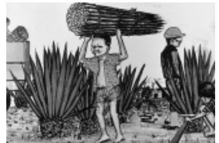
From a poster issued by the Child Labour Unit of the Tanzania Ministry of Labour and Youth Development, ATE, TFTU and the ILO.

In the rural areas, more than 25,000 out-of-school children are estimated to