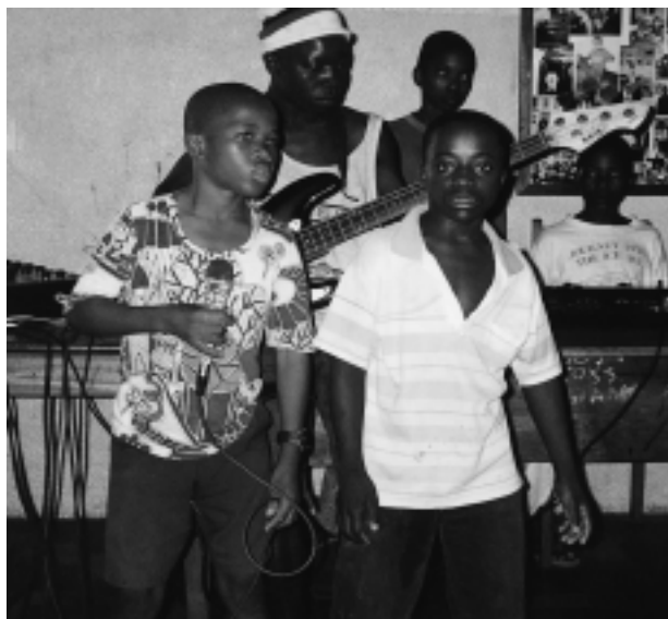
The Dogodogo Centre even has its own musical band of rehabilitated street children.