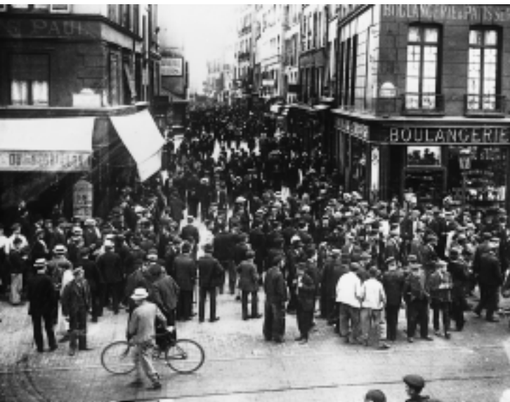
Social unrest in the early 20th century (France).

The Great War changed that. From the outset of the fighting, unions in several countries made clear that workers expected some return for the sacrifices demanded of them. Thus, from November 1914 onwards, the American Federation of Labor demanded that, once hostilities ended, a meeting of workers' representatives from various countries be held "to the end that suggestions may be made...as shall be helpful in restoring fraternal relations, protecting the interests of the toilers and thereby assisting in laying foundations for a more lasting peace".