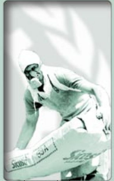
is workplace safety improving?