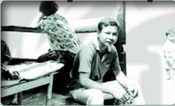
asia jobs crisis worse