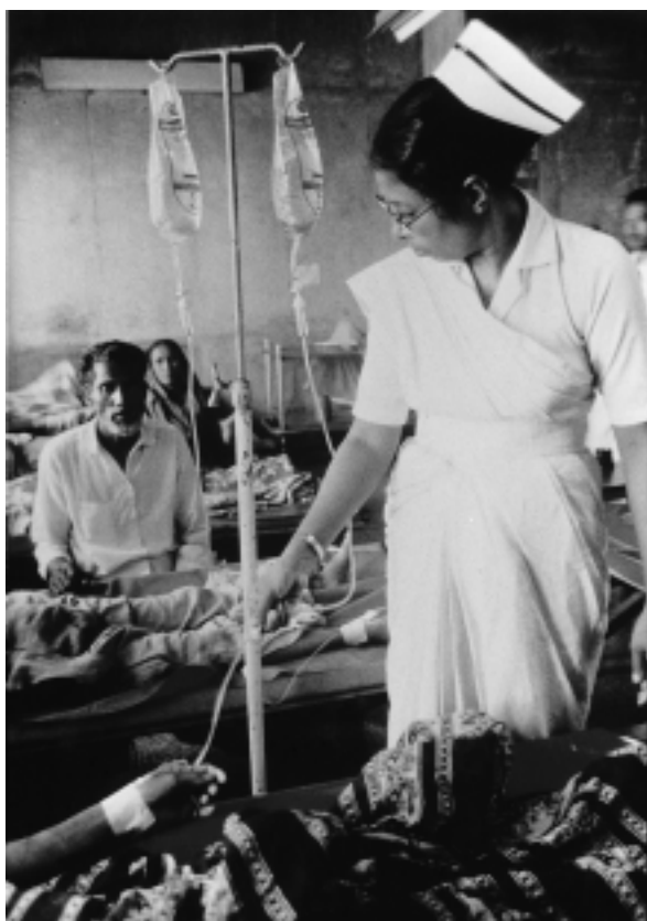
Canadian International Development Agency

nursing care and for the training of professional nurses, including those in specialized fields.