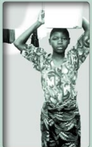
child labour in tanzania