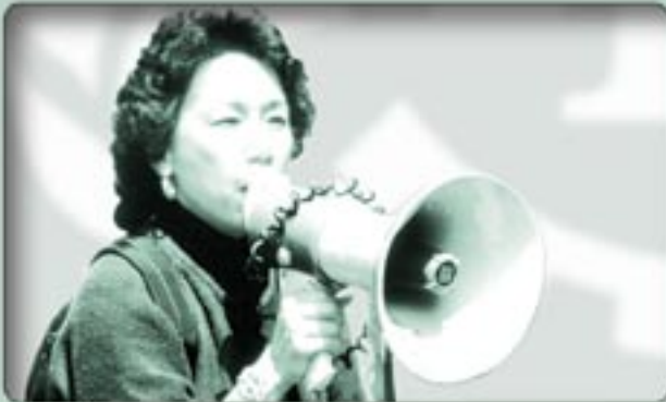
promoting workers' rights