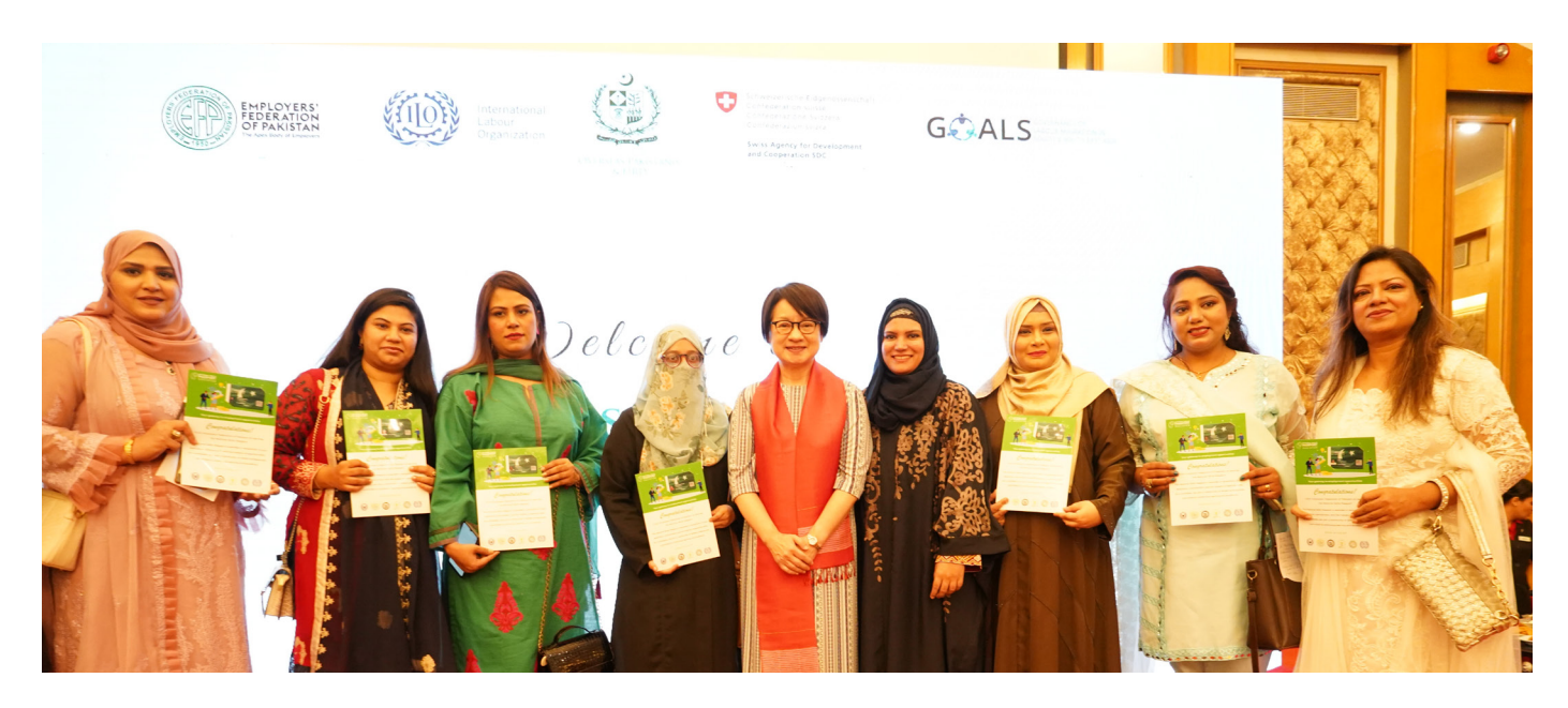
Skills Passport distribution ceremony in Karachi, Pakistan.