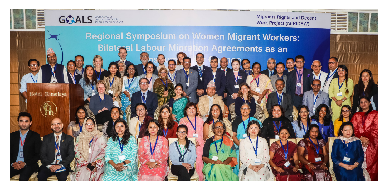
Regional Symposium on Women Migrant Workers with a focus on Gender Responsive Bilateral Labour Migration Agreements.