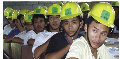
Facilitating youth employability in housing projects.

The Department of Labor and Employment (DOLE), the National Youth Commission (NYC) and the NEDA have accepted the challenge of forming a multi-stakeholder committee and convening it regularly to help define and push for the next steps and cross-institutional arrangements towards achieving greater coherence, coordination and adequacy of policies and programmes in addressing youth employment problems in the country.