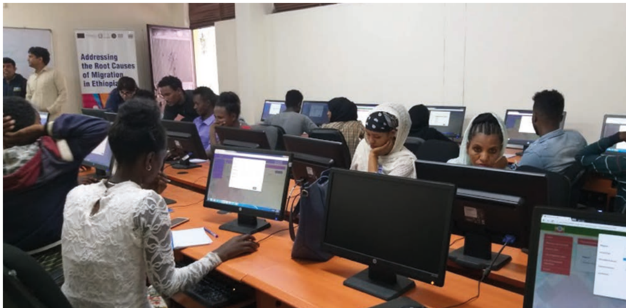
Figure 6. Jobseekers receiving DLE familiarization training.

Ethiopia confirmed its first COVID-19 case in the middle of March 2020. Since then, the GoE has been taking measures to curb the spread of the virus, including closure of schools, travel restrictions, banning public gatherings, and advising most employees to work from home. On 10 April 2020, Ethiopia's parliament declared a state of emergency (SoE), to remain in to effect for five months, and issued a list of mandatory prevention and control measures.