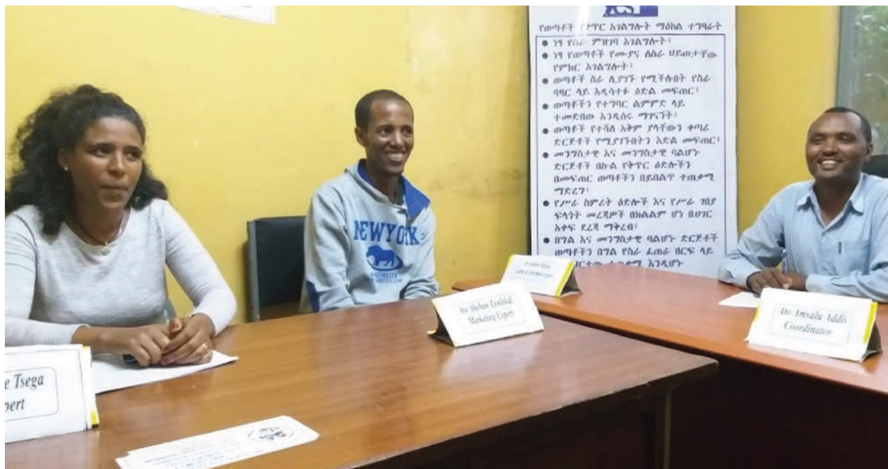
Figure 4. The Employment Services Centre, staffed, equipped and operational since July 2019.

The portal enables jobseekers to post their curriculum vitae – and employers to upload vacancies – online, and makes them searchable by key search criteria for both jobseekers and employers. The portal also has an Online Labour Exchange Nodal Centre for job matching and relevant services for both employers and jobseekers, such as information on employability, skills development, opportunities for apprenticeships/training programmes, and tips on writing CVs.