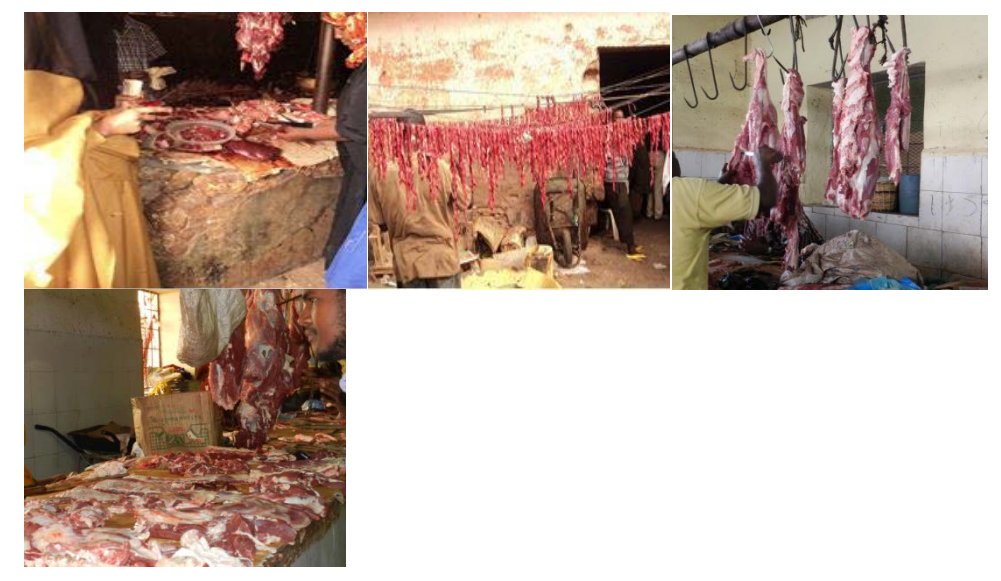
Photo set 4: Galkayo north meat market before and after construction

Site visit during this evaluation revealed that meat traders and other grocery traders were utilising the facility. Meat traders operated from inside the facility and a few from the extension where the grocery traders were located. This is seen in the photos below