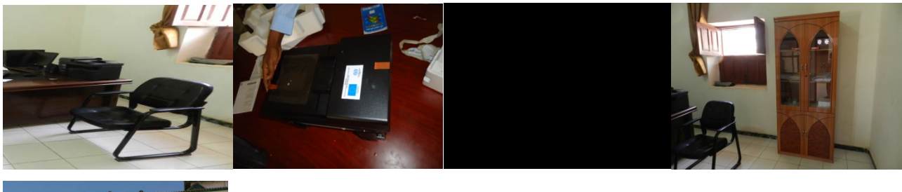
Photo set 9: Equipment and furniture donated to Galkayo north market forum

handover was conducted in December 2013 to the chair of the forum. The market forum in the north was functional and some members were met in the course of this evaluation. That in the south needed more support to strengthen its capacity. The institutions on the south were generally less developed and faced more challenges occasioned by insecurity.