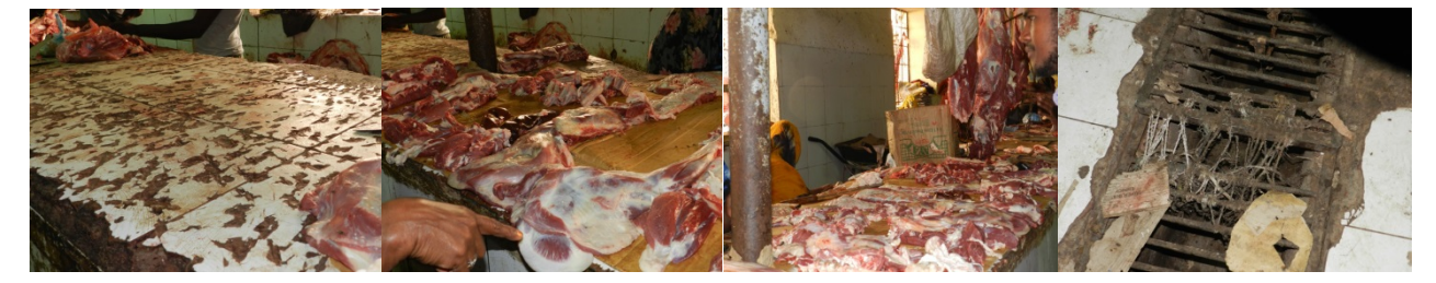
Photo set 6: Worn-out services, use of cartons and loose drainage cover that poses risks of injury

Further, traders were still displaying meat on cartoons, which albeit a popular practice, cartoons were noted to be highly absorbent and can easily result in contamination. This therefore required sensitisation of traders on associated risks and strengthened enforcement by the local authorities. Further, the drainage tunnel cover on the floor of the facility was visibly loose which could pose injury risks to traders and sellers alike. While traders called for a change in the design of the drainage cover to have concrete slabs that can be removed and replaced during cleaning, the PPP committee will need to step up its efforts in ensuring that the drainage cover was well maintained to prevent risks of injuries. This tiles, cartoons and drainage cover are seen below.